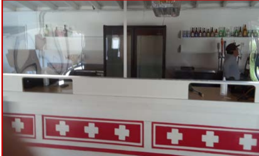
Beerhouse with new plexiglass installed